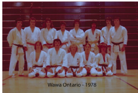
Wawa Ontario - 1978